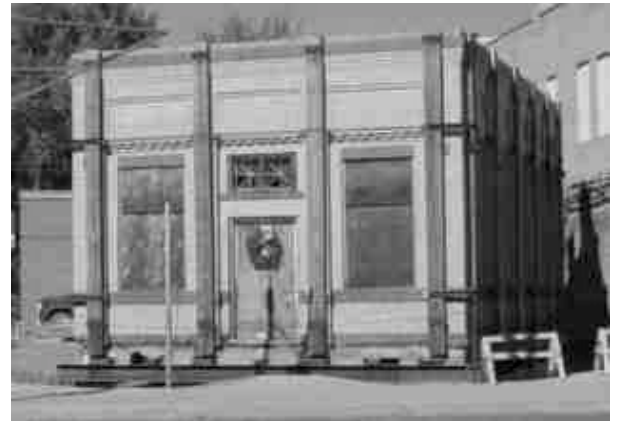
The old Vananda Bank building sitting on its new foundation will become the " Palomino Mercantile "