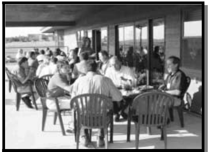
Participants in the Energy Open enjoyed a delicious prime rib dinner at Mulligans, sponsored by the City of Colstrip and Rosebud County.