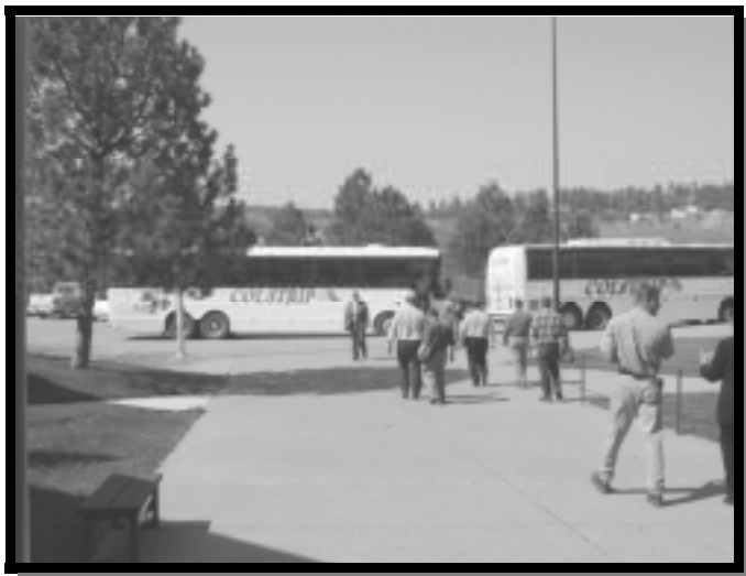
Colstrip High School provided the buses to take the participants on tours of the mines.