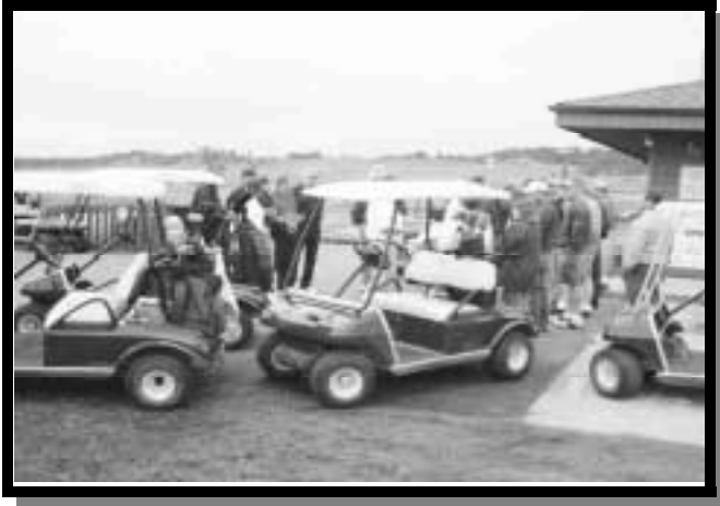
The golfers get their instructions from the Colstrip Golf Pro Glenn Godfrey.