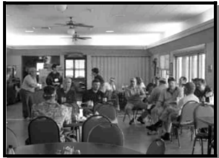
Participants in the Energy open wait for the