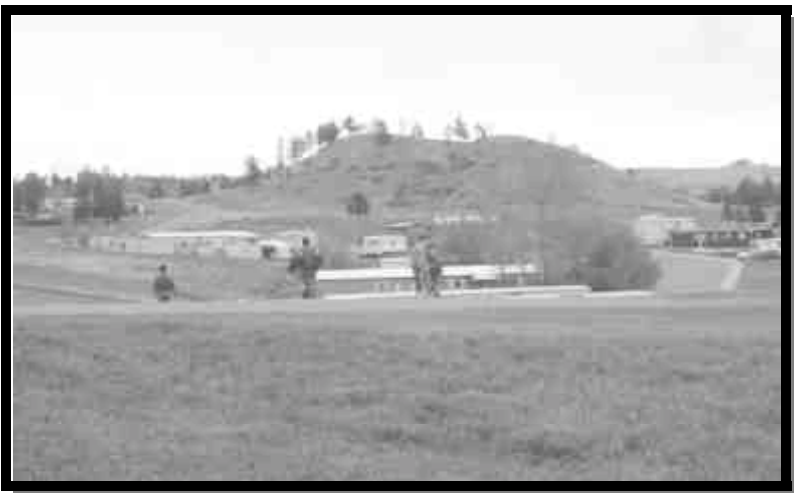
Shooting for the Hole in One Prize.