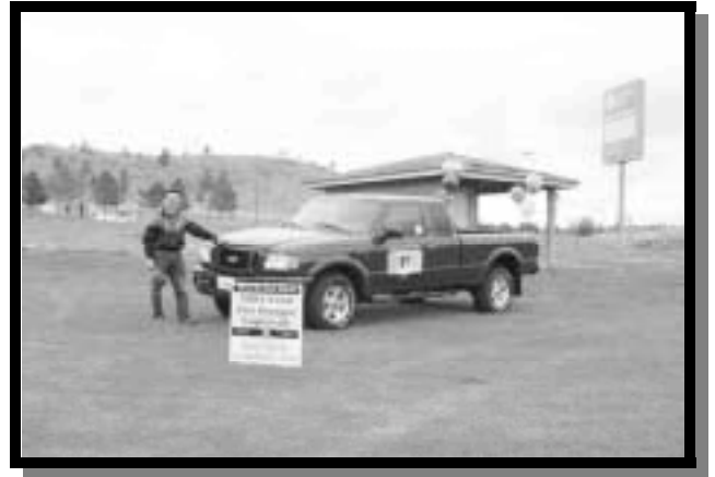
Hole-in One prize sponsored by Heberle Ford of Forsyth and the Colstrip Clinic.