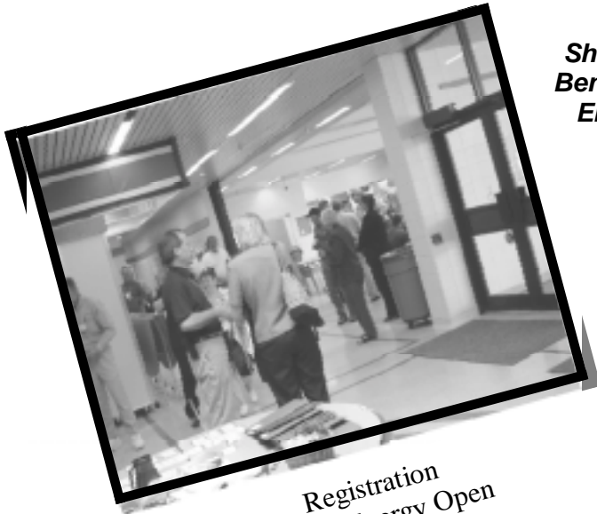
Registration At the Energy Open

Showcasing Economic Benefits of Responsible Energy Development